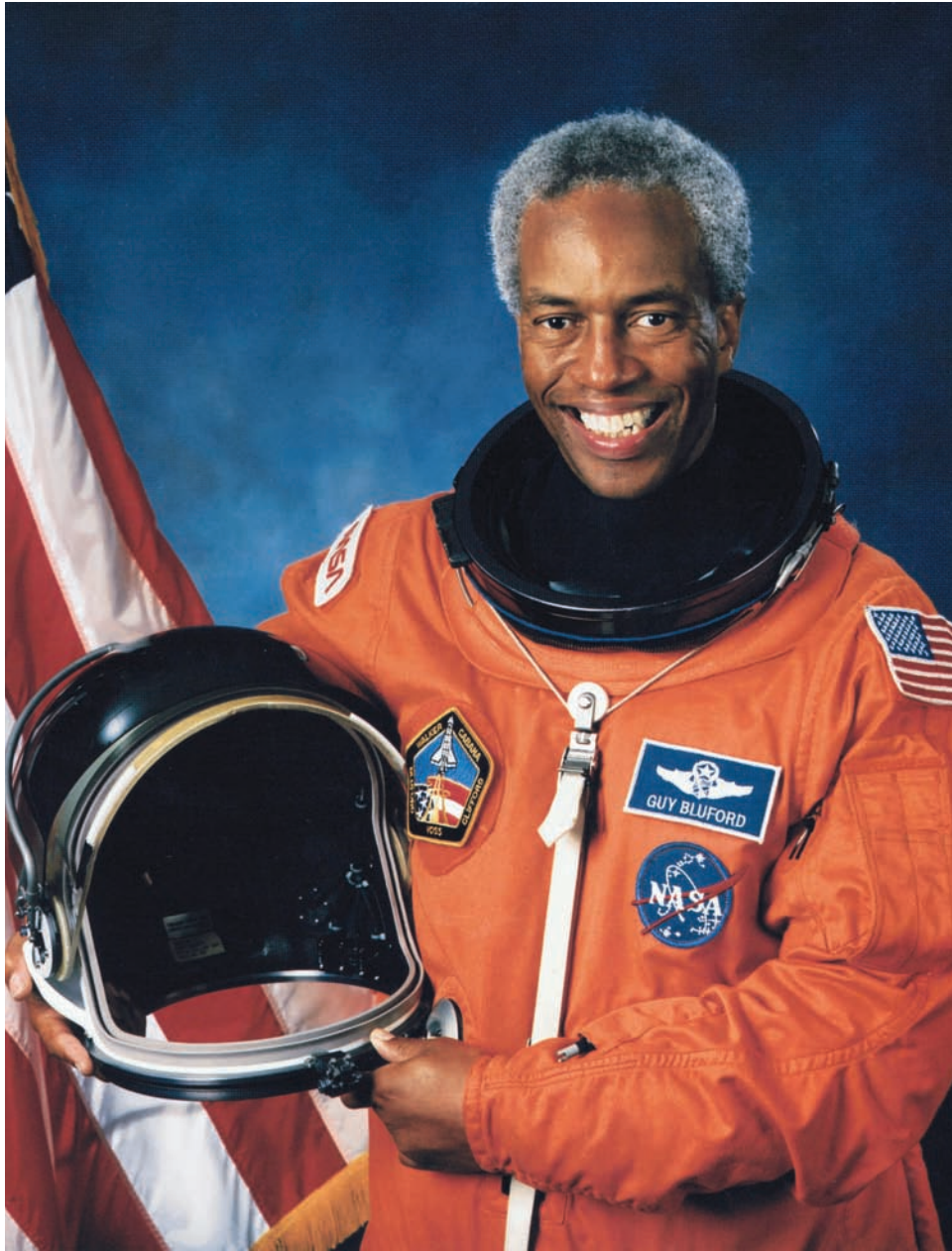
GUION S. BLUFORD, JR.

On August 30, 1983, the roar of rockets from Cape Canaveral's launch pad 39A marked the first of four ascents to earth's orbit for Dr. Guy Bluford.